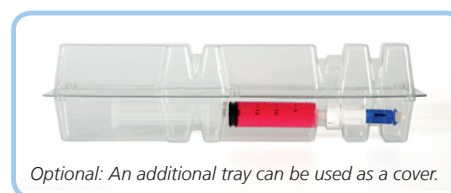
Optional: An additional tray can be used as a cover.

The Syringe Tray is used for carrying filled syringes during transport to the administration area. It is designed to accommodate 1–30 mL syringes with Injector Luer Lock N35. Non-sterile.